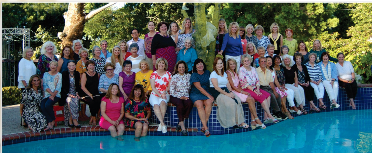
2019 Steel Magnolias Members